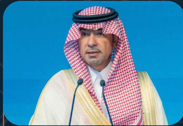
H.E. Mr. Majed Al-Hogail Minister Municipalities and Housing