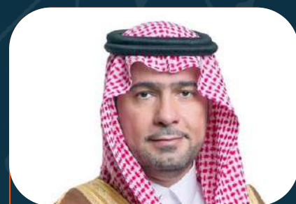
H.E. Mr. Majed Al-Hogail Minister Municipalities and Housing