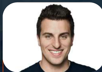
Mr. Brian Chesky CEO and Founder Airbnb