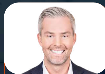
Mr. Ryan Serhant American Entrepreneur and Author